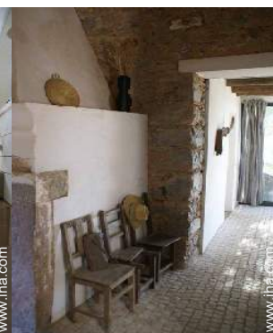
Charming Old Farm