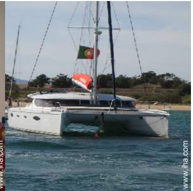
summer sports nearby