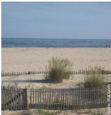
summer sports nearby