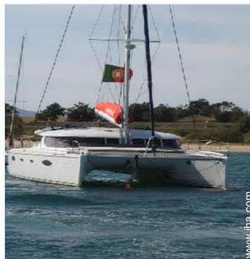
summer sports nearby