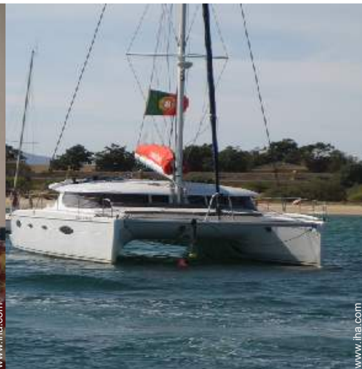
summer sports nearby