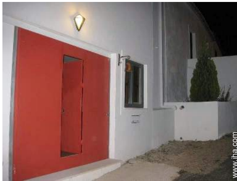
Main Farm House