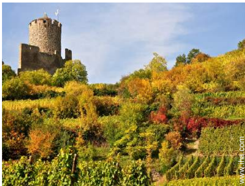
view over vineyard