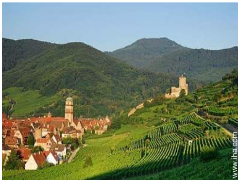
view over vineyard