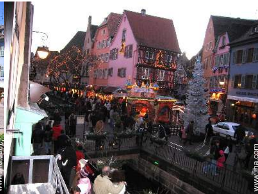
view over the square