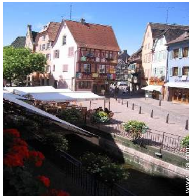
view over a pedestrianized street