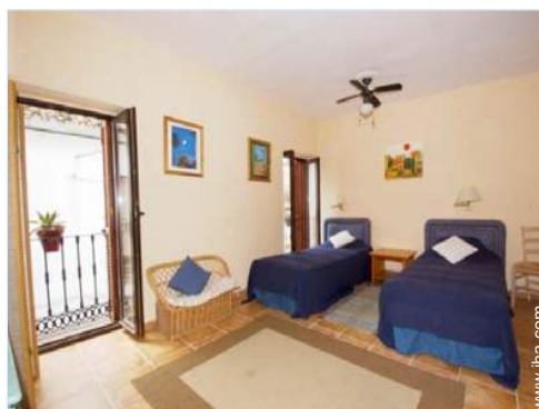
two twin beds