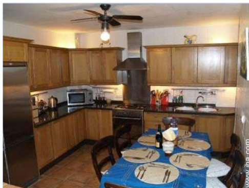
large american style kitchen