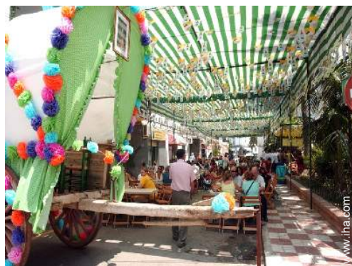
view of the city