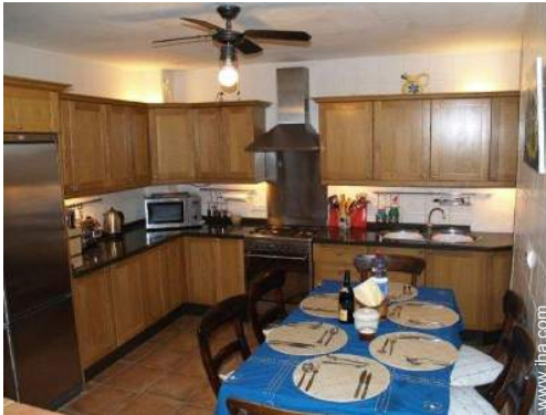
large american style kitchen