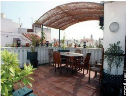
summer living area