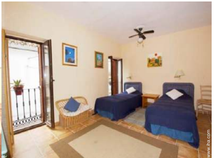
two twin beds