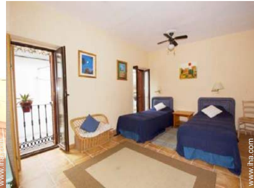
two twin beds