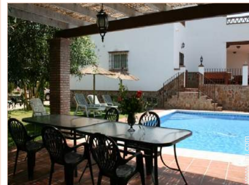
yard seated area