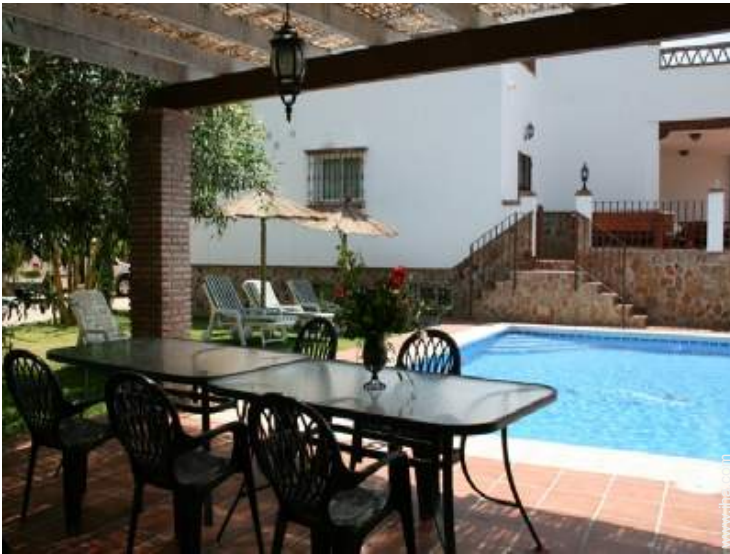
yard seated area