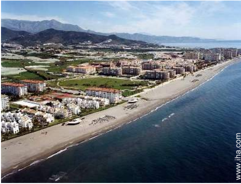
summer sports nearby