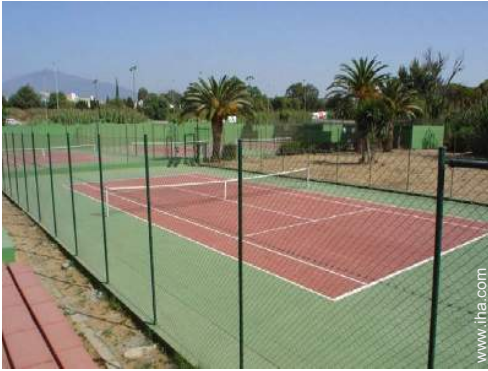
Tennis - hard surface