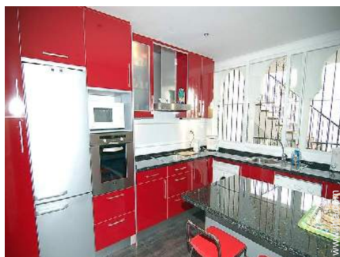
large separate kitchen