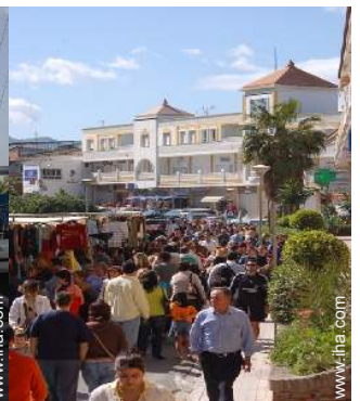
Cities close by