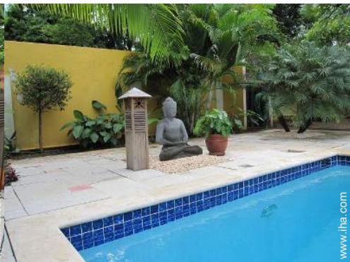
Rectangular swimming pool