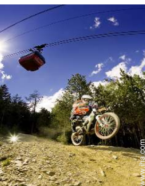
mountain pursuits nearby