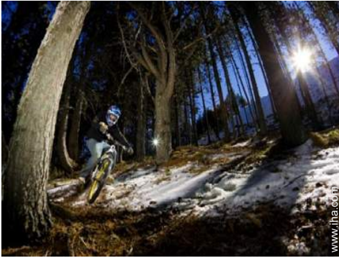
mountain bike (path)