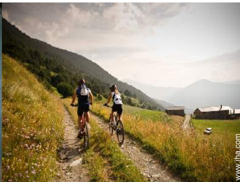
mountain pursuits nearby