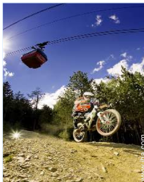
mountain pursuits nearby