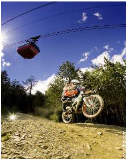
mountain pursuits nearby