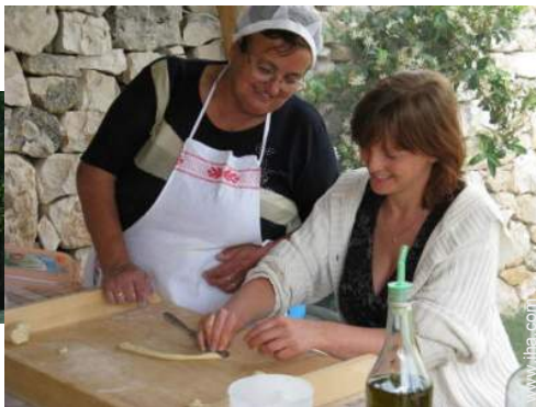
locally produced meals