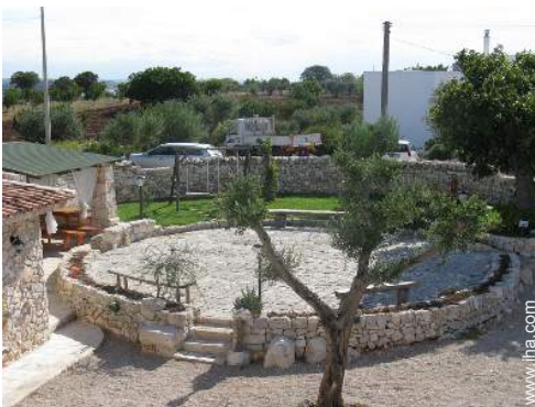
Outside at the guests disposal