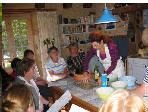
large separate kitchen