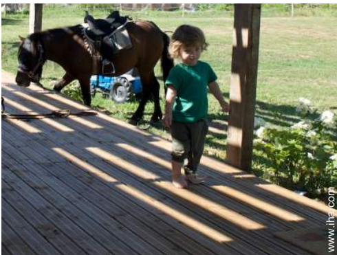
horses and riding equipment