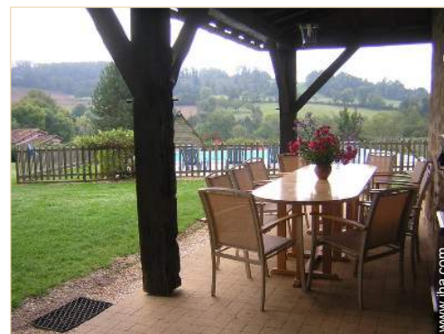
yard seated area