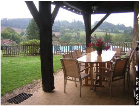
yard seated area