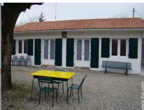
yard seated area