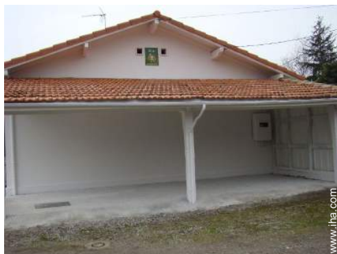
Exterior facilities at guests disposal