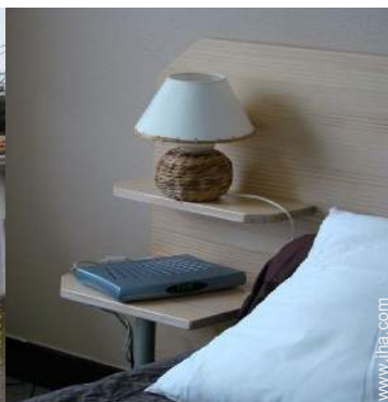
wifi (wireless internet access)