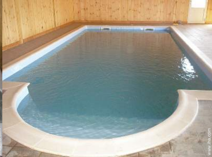
Inside swimming pool