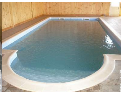
Inside swimming pool