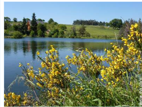
view over the lake