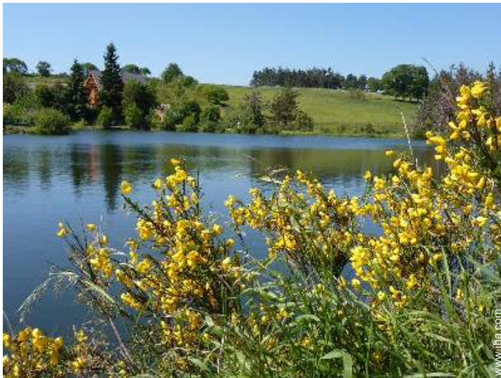
view over the lake