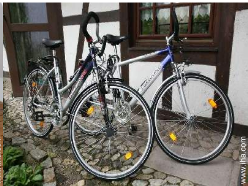
mountain bike (path)