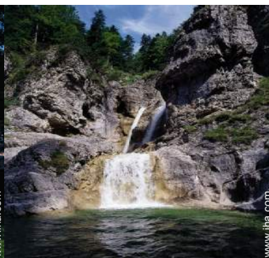
mountain pursuits nearby