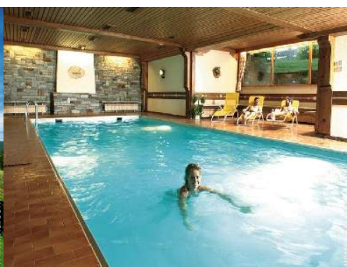
Inside swimming pool