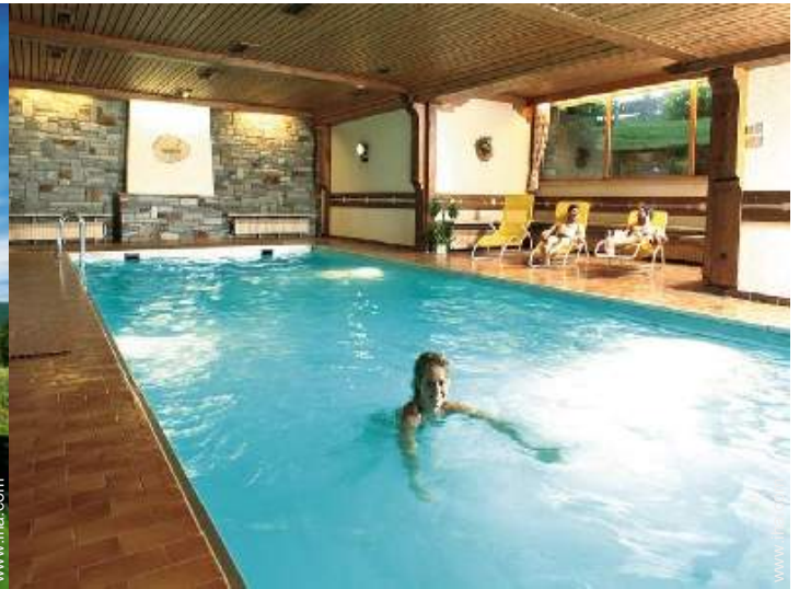
Inside swimming pool