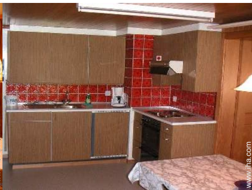
large seperate kitchen