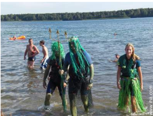
summer sports nearby