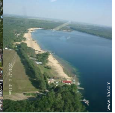
view over the lake