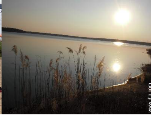
view over the lake