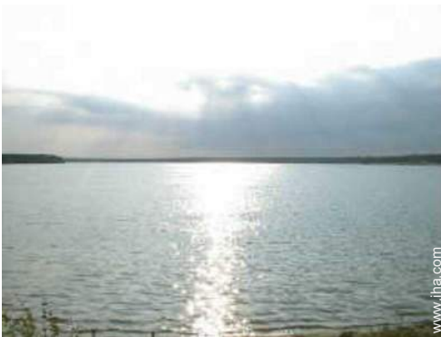
view over the lake