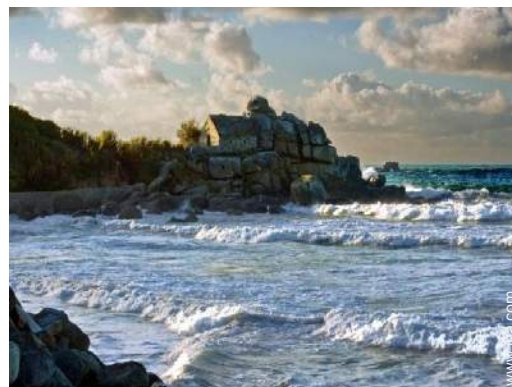
view over the ocean