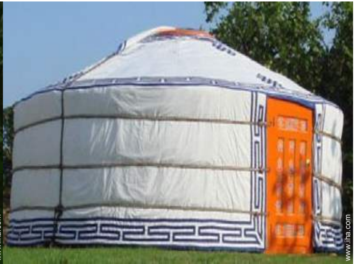
Charming Yurt (Mongolian tent)