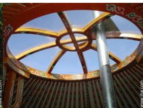
Charming Yurt (Mongolian tent)