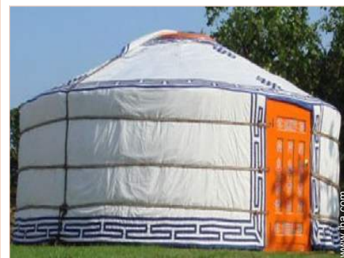
Charming Yurt (Mongolian tent)