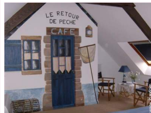
The chambre d'hôtes/B&#38;B