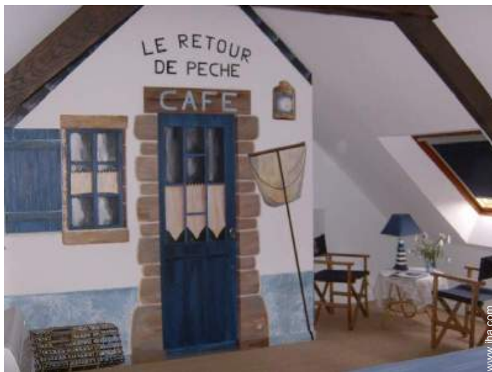
The chambre d'hôtes/B&#38;B