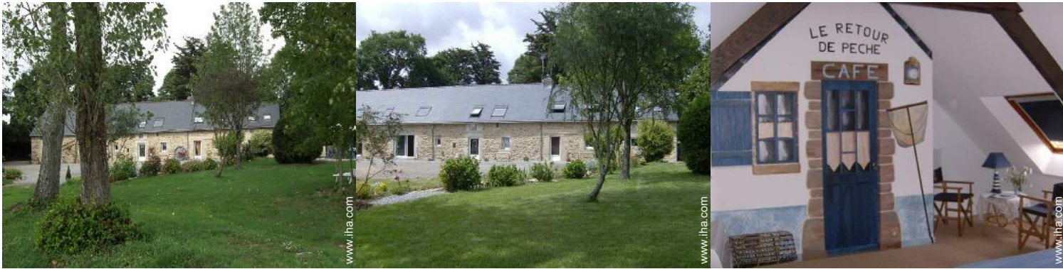
The chambre d'hôtes/B&#38;B