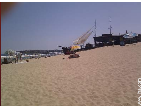
scuba diving material hire