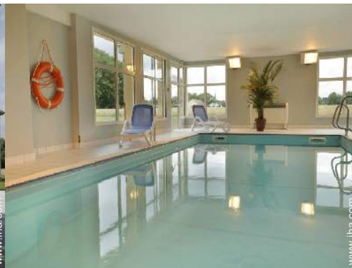
Inside swimming pool