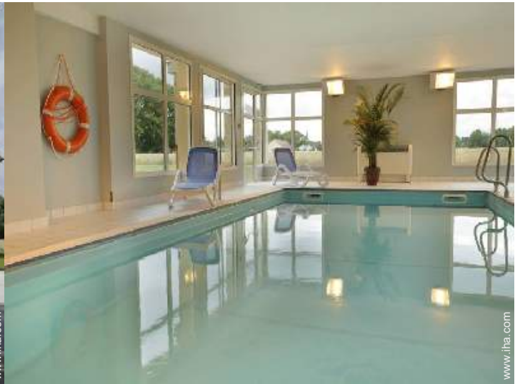
Inside swimming pool