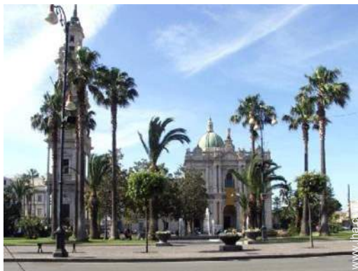
Cities close by