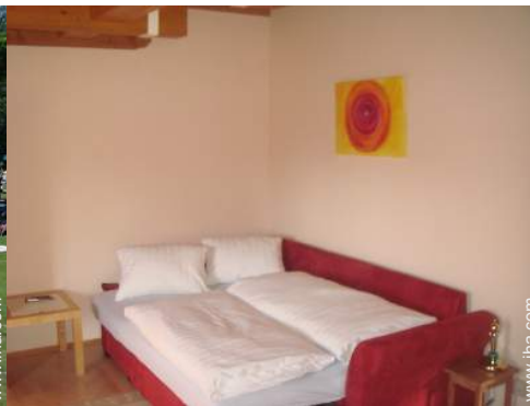
sleepers sofa(s) 2 pers