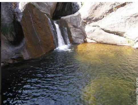
natural spring baths