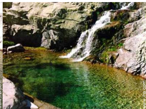
natural spring baths