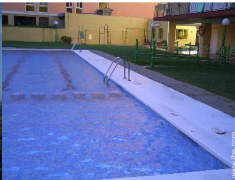
Rectangular swimming pool