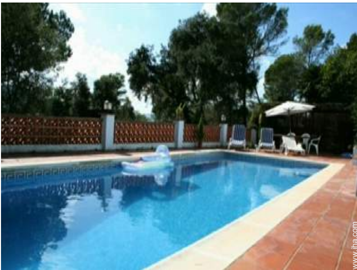
Facilities exclusive to