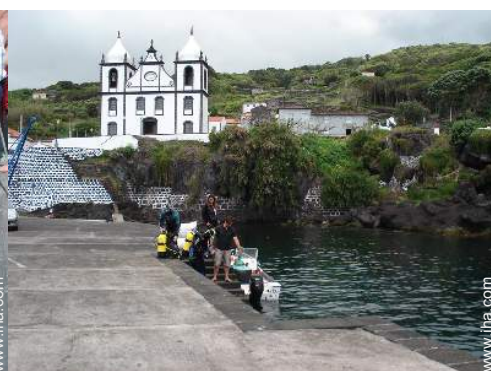
Scuba diving (Standard diving dress)