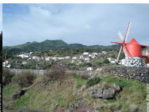
antiques &#38; bric-a-brac