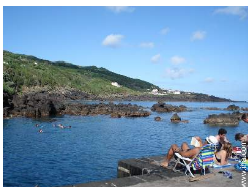
natural spring baths