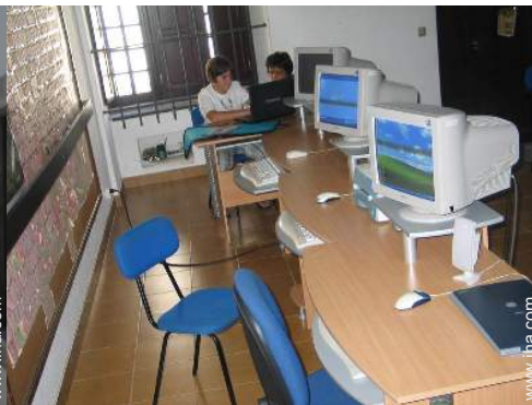
wifi (wireless internet access)