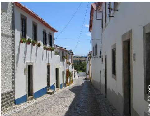
view of the village center