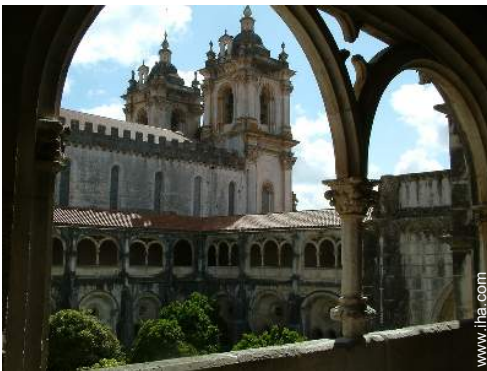
Cities close by