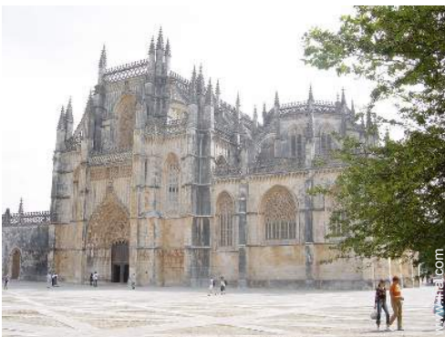
Cities close by