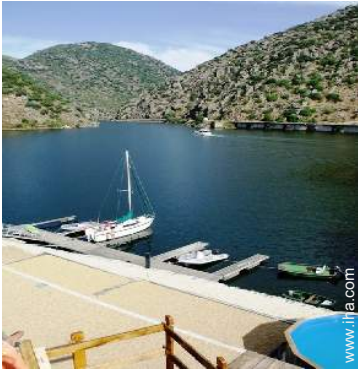
view over the lake