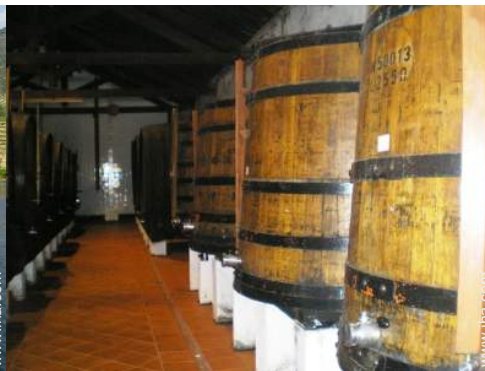
cellar and wine tasting