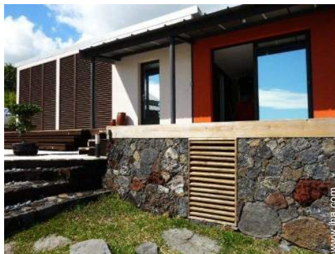
outside shower facilities