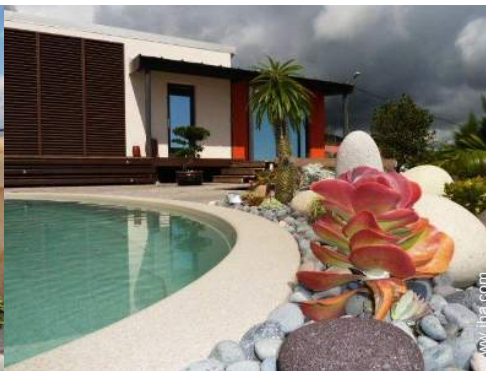
Charming Studio Flat