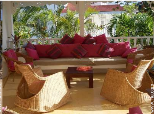
summer living area