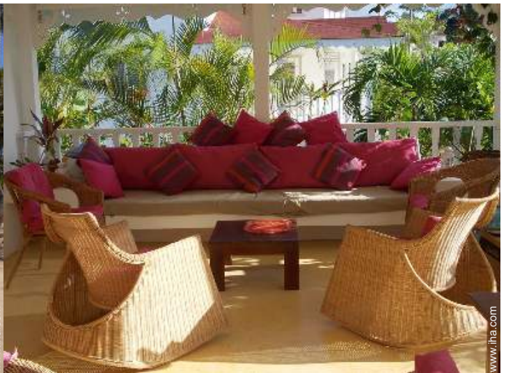
summer living area