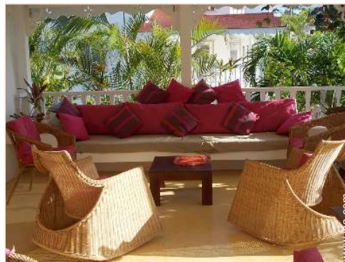
summer living area