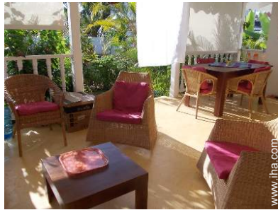
summer living area