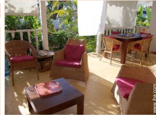
summer living area