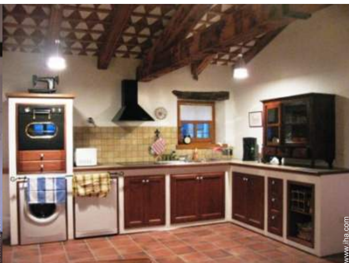
typical style kitchen