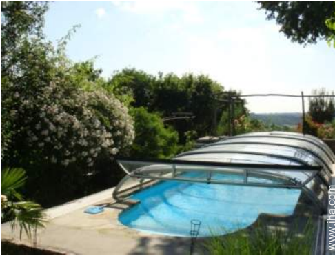
Covered swimming pool