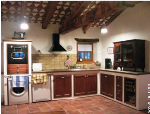
typical style kitchen