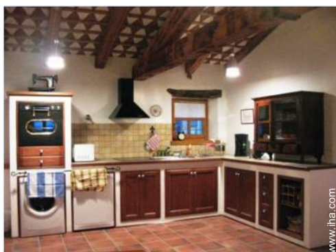
typical style kitchen