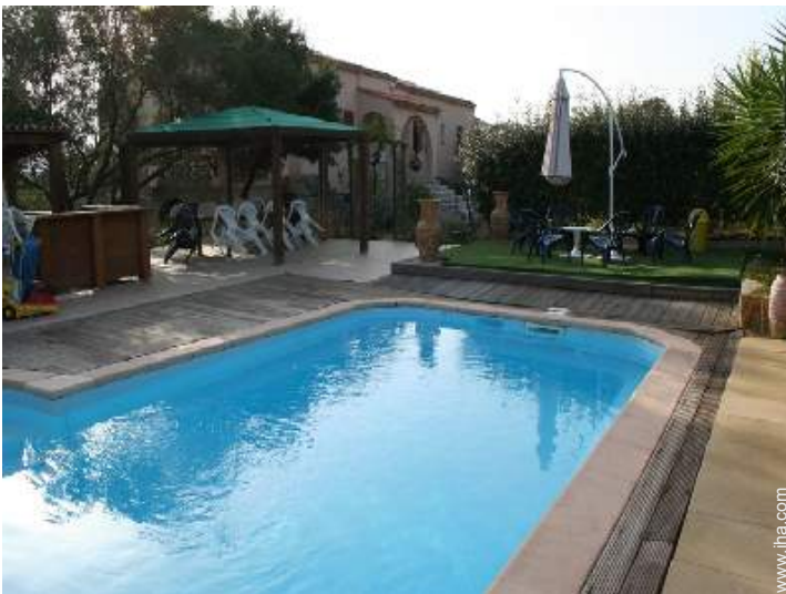
yard seated area