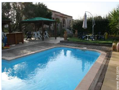
yard seated area