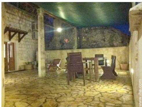
summer living area