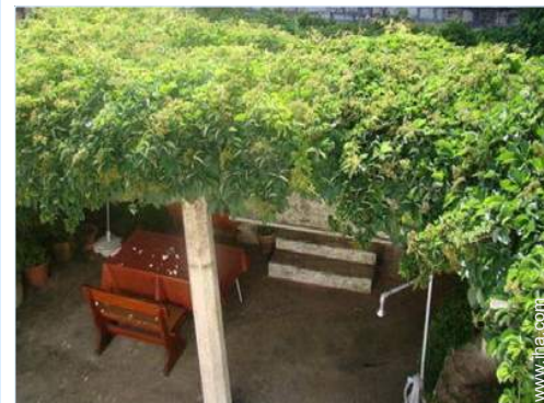
summer living area