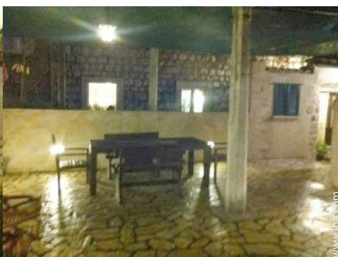
summer living area