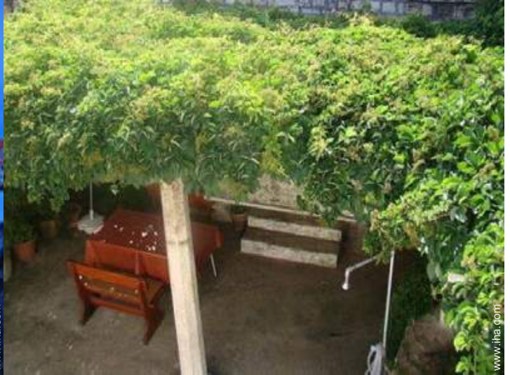
summer living area