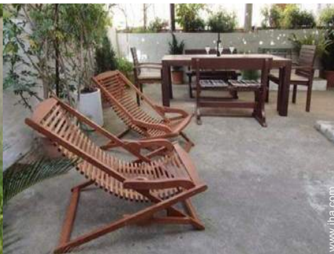
summer living area