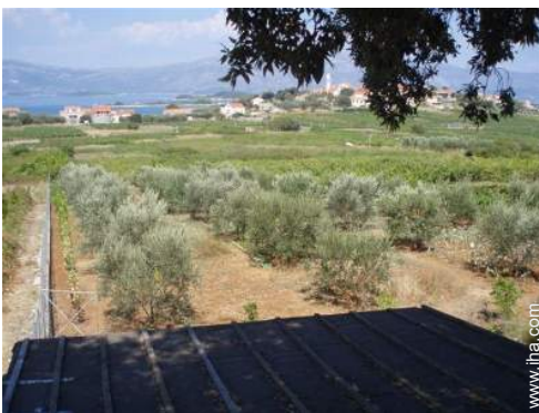
view over vineyard