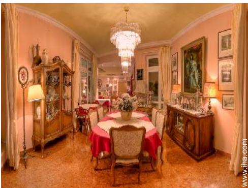
Interior layout at guests disposal