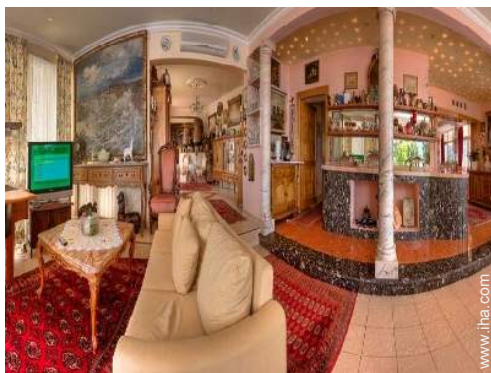
Interior layout at guests disposal