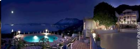
Exterior facilities at guests disposal