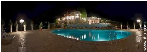
Exterior facilities at guests disposal