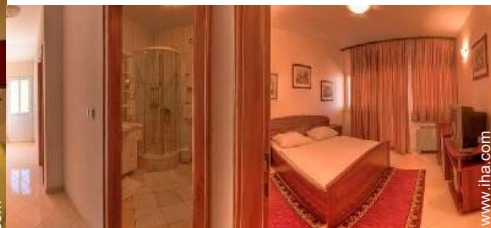
Interior comforts at guests disposal