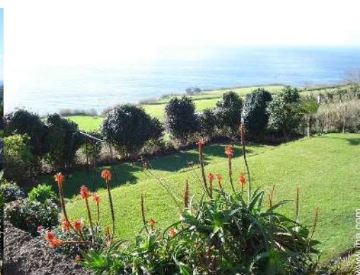
view over farmland