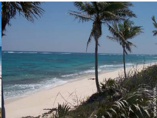
view over the ocean