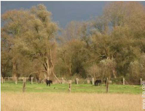
view over prairie