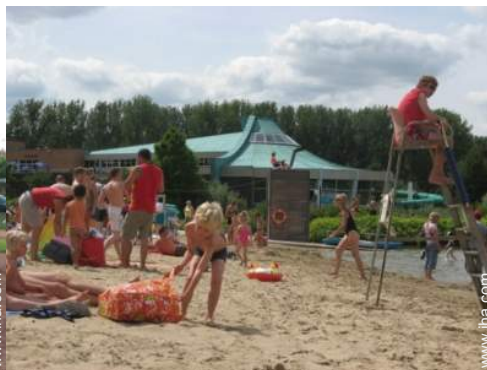
public swimming pool