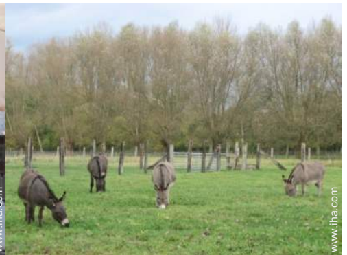
view over prairie