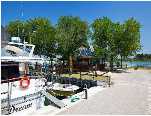
marina mooring space