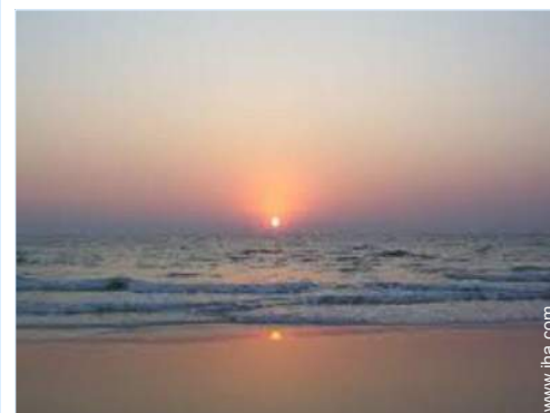
view over a pedestrianized street