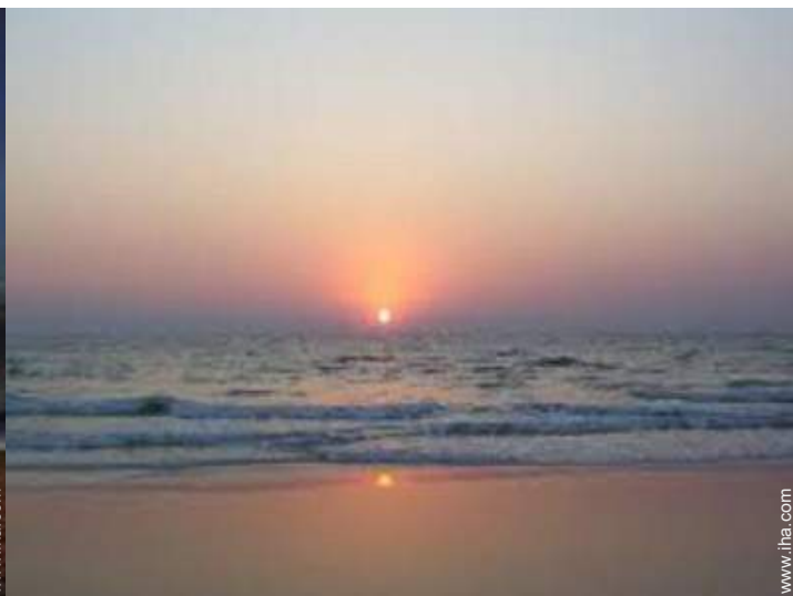
view over a pedestrianized street