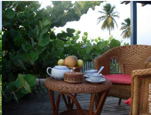
summer living area